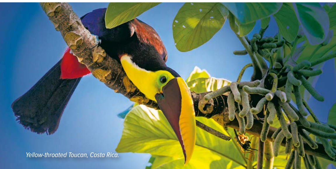
Yellow-throated Toucan, Costa Rica.

8 DAYS/7 NIGHTS—NATIONAL GEOGRAPHIC QUEST