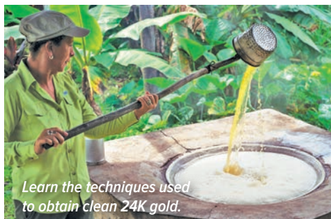
Learn the techniques used to obtain clean 24K gold.

The Osa Peninsula, largely inaccessible and less visited, is the crown jewel of Costa Rica and the focus of this exploration. It contains more than fifty percent of the country's biodiversity and Corcovado National Park—one of the largest protected areas left on the Pacific Coast of Central America. Visit a private reserve and discover a virgin rainforest—with giant trees, thousands of plant species, birds, insects, and mammals. Visit a traditional sugar cane mill to learn about the process of producing delicious juices and snacks. Then, take a cooking class and make a tasty local dish or pan for gold at an artisanal gold mine, accompanied by a former gold miner-turned-conservationist.