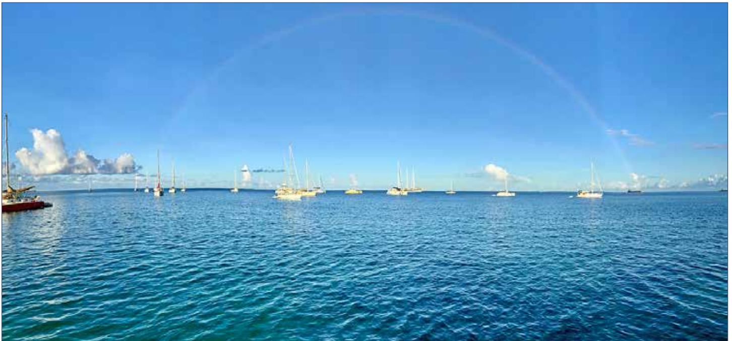
Anchorage at St. Georges

We are sailing with the twin operations of Moorings and Sunsail. They operate together in the same marina on St Lucia as a single operation making it very convenient for all our crews. We have sailed with Moorings since 1985 as well as Sunsail since 2006 and have experienced the best prepared yachts and the most engaged service of any charter companies we have used.