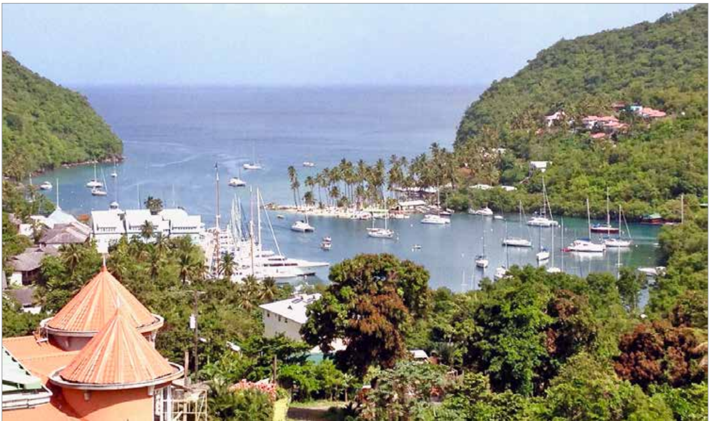
Overlooking Marigot Bay

Marigot Bay , on the west coast of St Lucia, lies about 12 nautical miles (NM) from the Moorings/Sunsail base. It is a beautiful, protected bay that makes for a very convenient and comfortable first night anchorage after spending some of the day preparing yourselves and the yacht for the cruise. There are restaurants and bars and one of the most iconic sunset scenes in the Caribbean.