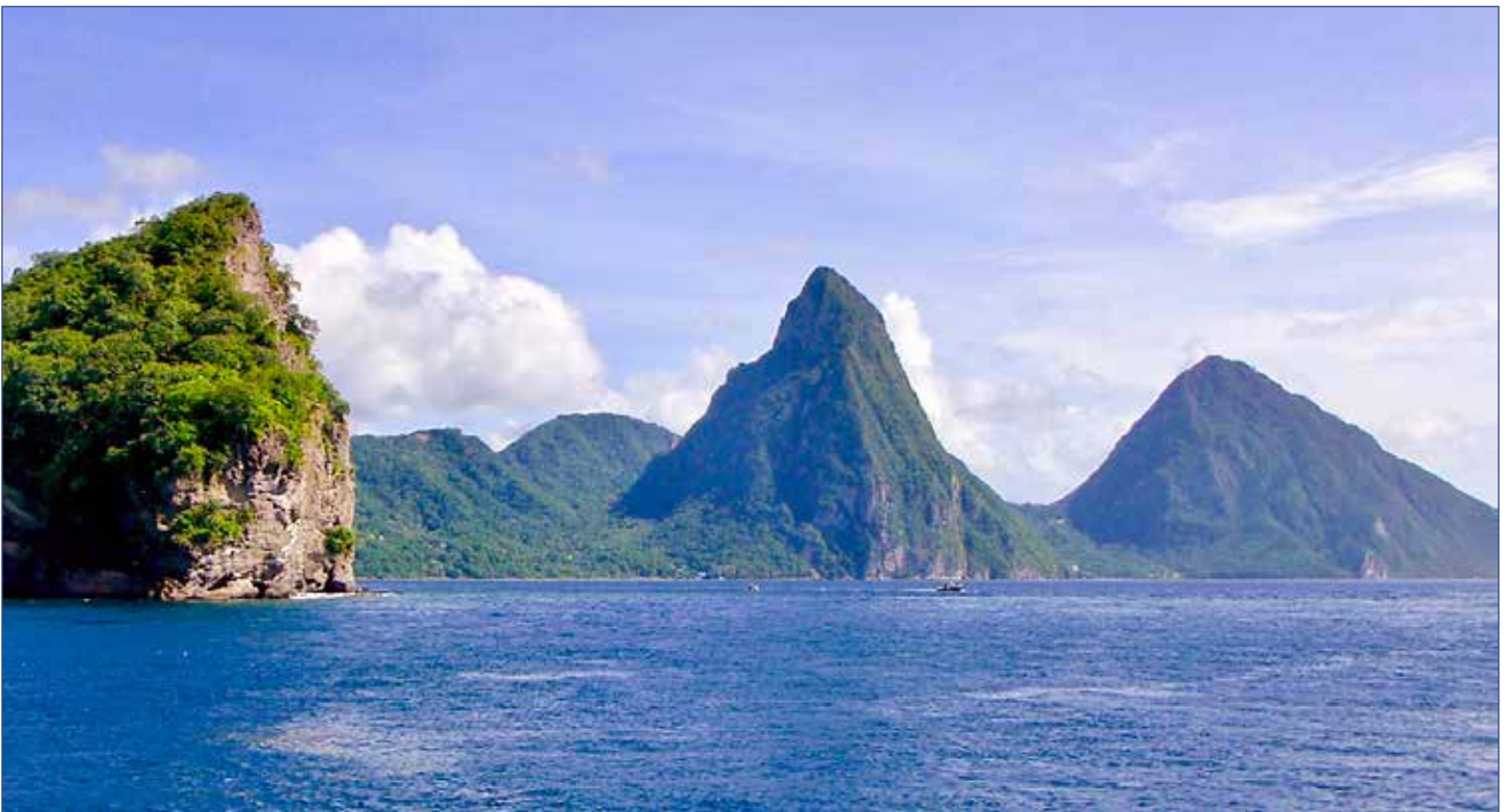
Pitons as seen from Anse Chastenet

Tobago Cays (pronounced "Keys"), an archipelago of five tiny islands, is protected by a huge reef to the east, creating one of the best snorkeling playgrounds in the world. You can moor in locations that have only Horse-shoe Reef between you and Africa and a completely placid anchorage of crystal clear water and "off-the-yacht" incredible snorkeling. Many of you will decide to remain for a second night, it is so beautiful and romantic.