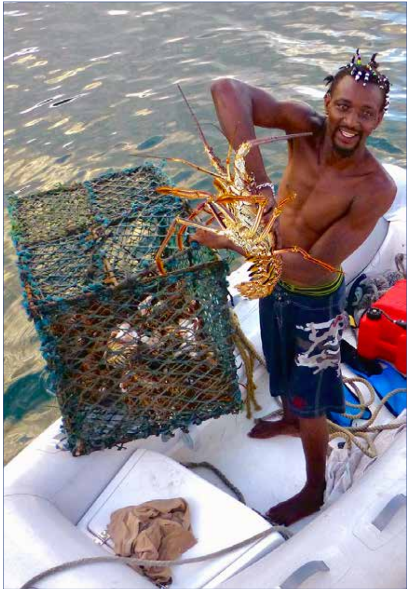
Lobster for sale in Salt Whistle bay

Other magical spots exist on other islands, as well. Explore the jet set island of Mustique or the authentic Old Caribbean flavor and culture found on St Vincent, Union, Canouan and Carriacou Islands. In the run-up to our trip we will do deep dives into the magic of these islands as well as we prepare you for your adventure.